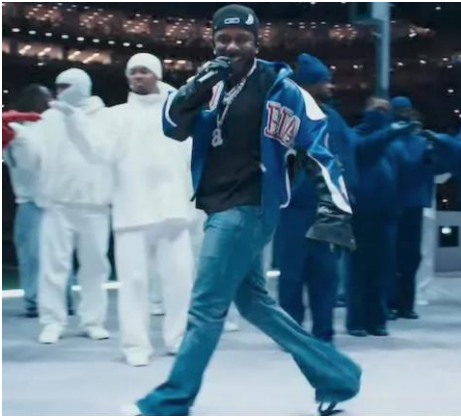
When you see your favorite Whiting Public Library librarian at the circulation desk

I also jumped on the SuperBowl meme trend on social media posting these pictures that gained a lot of attention to the library accounts. It brought on quite a few new followers as well, and a few attended programs later in the month!