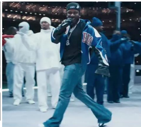
When you see your favorite Whiting Public Library librarian at the circulation desk