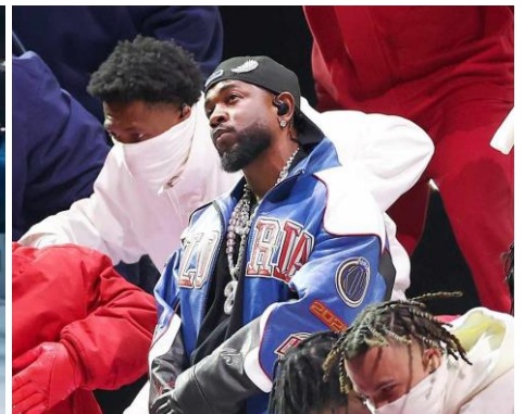
If you're not taking advantage of Whiting Public Library's free materials and services, you're Not Like Us.