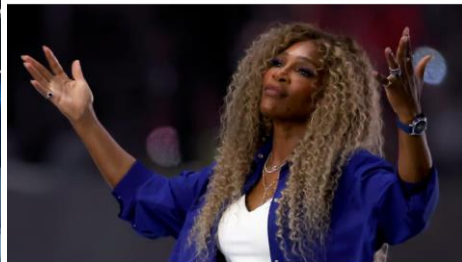
When you just saved hundreds of dollars by borrowing items from the Library of Things.